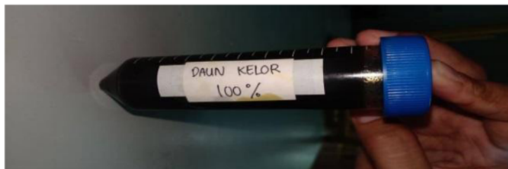
Figure 1 Ethanol Extract from Moringa