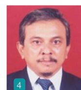
4 (+ Corresponding author)

4 Email: mahdani@unsyah.ac.id Tel: +62811681055