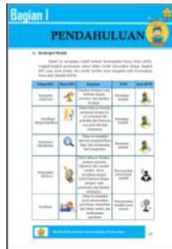
Page 1 Module