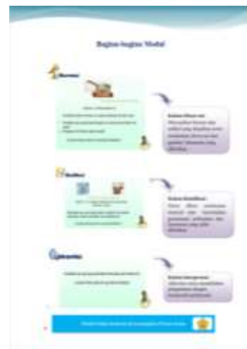
Page 3 Module