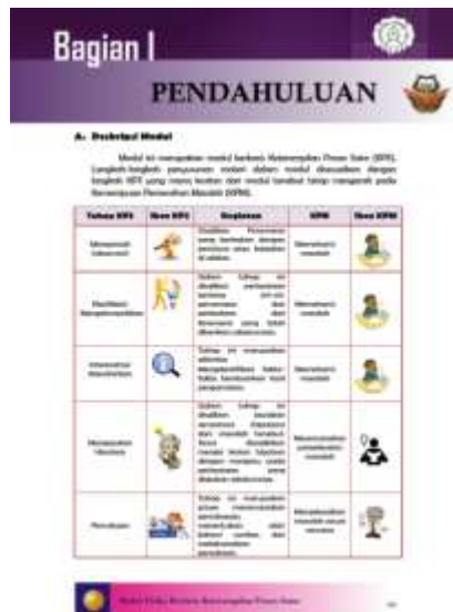
Page 1 Module