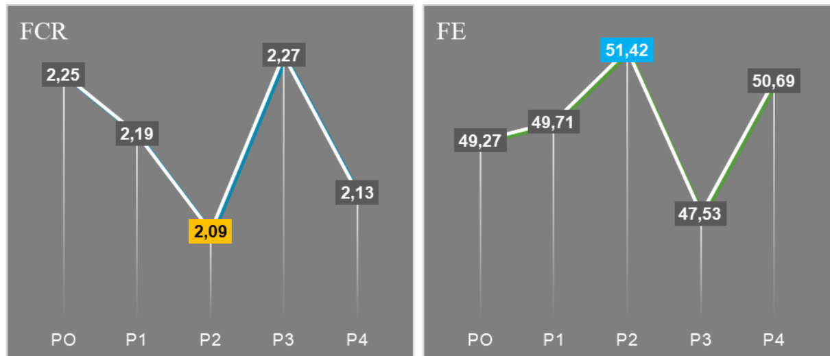
Figure 2. Increase in feed conversion and efficiency of meat chicken due to fed on fermented diet containing probiotics digestive enzymes.

and local material to broiler chickens with the addition of digestive enzymes was 0.5 percent (P2) higher than other treatment with the addition of probiotics. The high diet conversion rate was due to the better digestibility of fermented diet containing digestive enzymes where chickens easily absorb all the nutritional value supplied by the maggot flour and local ingredients in fermented diet. In addition, maggot and local ingredients are able to supply protein, amino acids and other ingredients according to nutritional requirement of broiler growth.